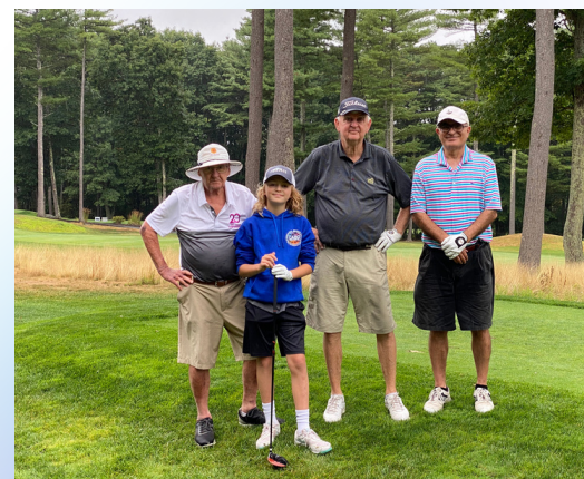
Golf Classic Monday, October 2