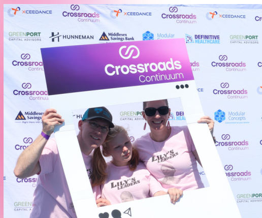
5K and Family Fun Day Sunday, June 4

Fundraising events provide necessary operating support for our programs and fulfill our mission by bringing our community together and celebrating the individuals we serve.