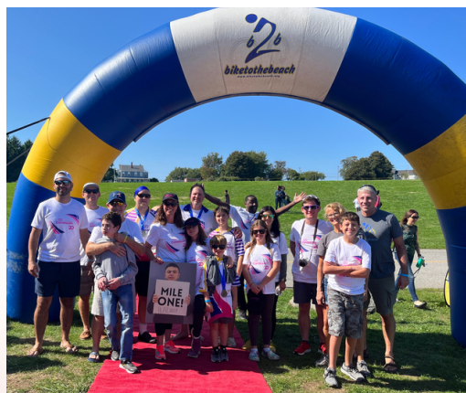
Bike to the Beach Saturday, September 23